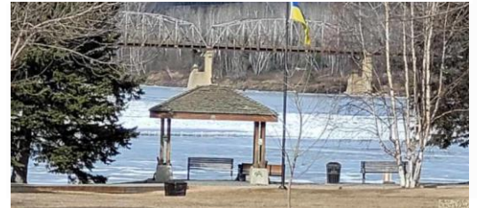
Athabasca River at Town of Athabasca. April 10, 2022