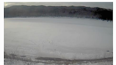
B Athabasca River below Crooked Rapids April 12, 2022 – 0900hr rivers.alberta.ca

Emergency Management, Regional Emergency Services