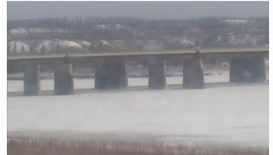
River Breakup Camera at Water Treatment Plant, south of the bridge, facing downstream (north). April 12, 2022 – 1120hr Watch it live here