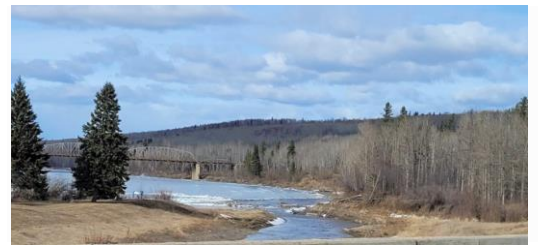
Athabasca River at Town of Athabasca. April 10, 2022