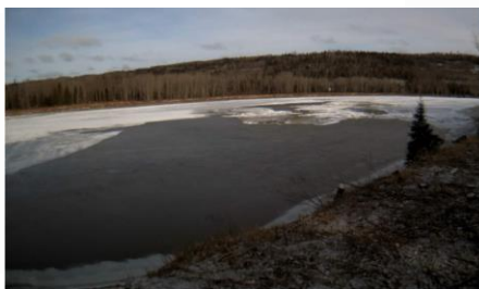
A Athabasca River above House River April 12, 2022 – 0900hr rivers.alberta.ca