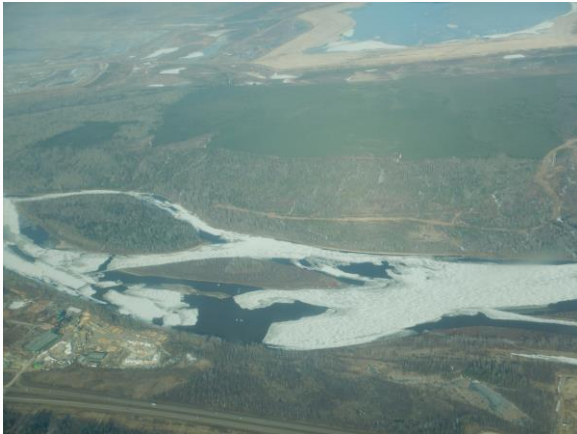
Intact but deteriorated ice cover on the Athabasca River (flow from right to left) at km 278.5 (at Willow Island). Photo taken April 18, 2022.

Visit rivers.ab.ca for full reports and more photos