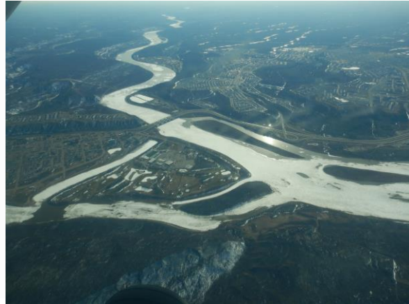
Intact ice cover on the Athabasca River (shown on the right, flow from top to the right) and Clearwater River (shown on the left, flow from the left to right) at km 293 (downtown Fort McMurray). Photo taken April 18, 2022, courtesy AEP.