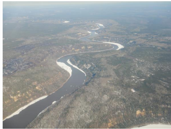
Open water on the Athabasca River (flow from top-right to bottom-left) at km 395. Photo taken April 18, 2022..