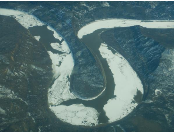
Intermittent ice cover on the Athabasca River (flow from right to left) at km 335 (Crooked Rapids). Photo taken April 18, 2022.