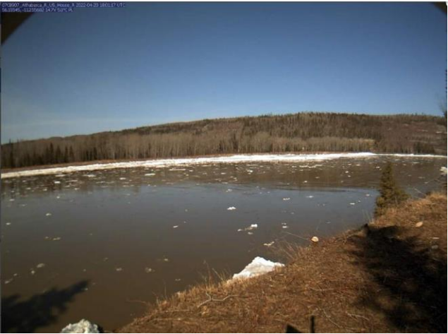
Open water on the Athabasca River above House River at 1200h April 20, 2022.