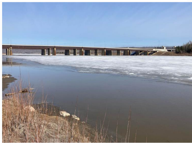
Partial ice cover on the Athabasca River by Hwy 63 bridge at 1430h April 20, 2022.