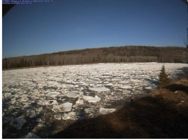
Ice run on the Athabasca River above House River at 1100h April 20, 2022.