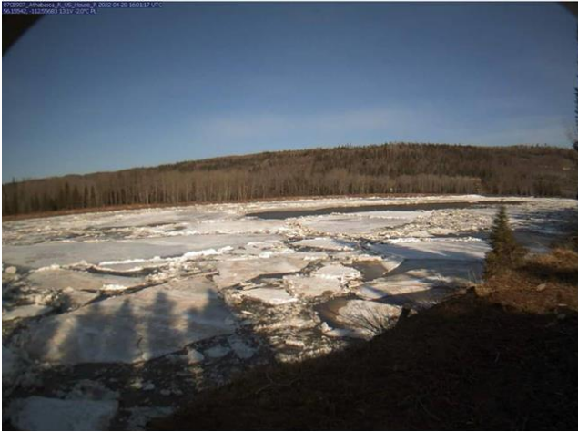
Deteriorated ice cover on the Athabasca River above House River at 1000h April 20, 2022.

Visit rivers.ab.ca for full reports and more photos