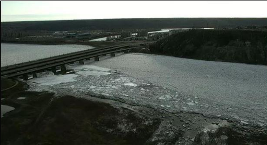
Ice run moving through Fort McMurray at Hwy 63 bridge. 0755h April 21, 2022.