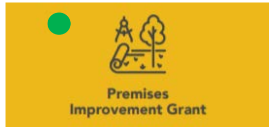
Premises Improvement Grant