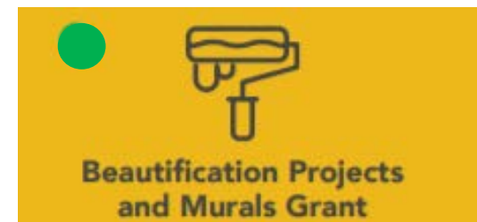
Beautification Projects and Murals Grant