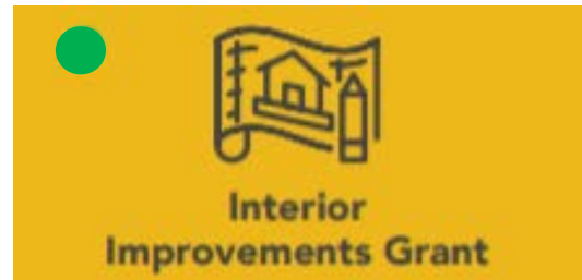
Interior Improvements Grant