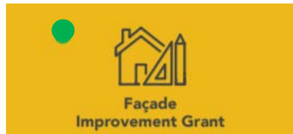
Façade Improvement Grant