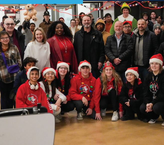
Members of Council joined the "Stuffing Day" team in support of the 8th annual Stuff-A-Bus Toy Drive.

We recognize there is value in working together. We welcome insight and appreciate collaboration from all groups and stakeholders in order to bring together elements that will help ensure communities continue to grow into the homes we love and homes which welcome others.