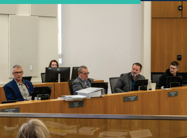
Budget 2024 deliberations took place in December with Council approving a $611.6 M municipal budget.

Our world is changing. The revenue we enjoy to provide services will not last forever. It is critical that we build our community and its future upon policies and investments that are fiscally, environmentally, and socially sustainable and enduring. Developing a long-term fiscal budget and strategy will ensure sustainable growth and high-level quality services.