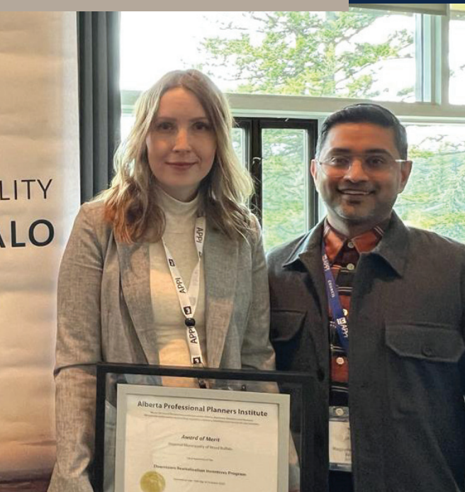
Staff members received an award of merit for the Downtown Revitalization Incentive Program.

The downtown has struggled over time with indecisions, rapid changes in decision, and natural disasters for too long. It is time to choose what downtown will be and lay out a plan for redevelopment and disaster mitigation and carry on with implementation.