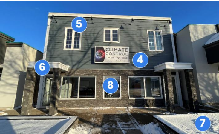
Figure 4: Comprehensive Facade Example

Major Improvements (comprehensive projects – 4 or more):