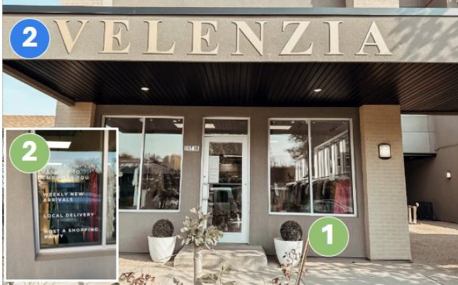
Figure 2: Storefront Facade Example