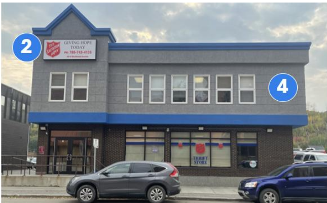
Figure 3: Simple Facade Example

Major Improvements (simple projects – 1 or more):